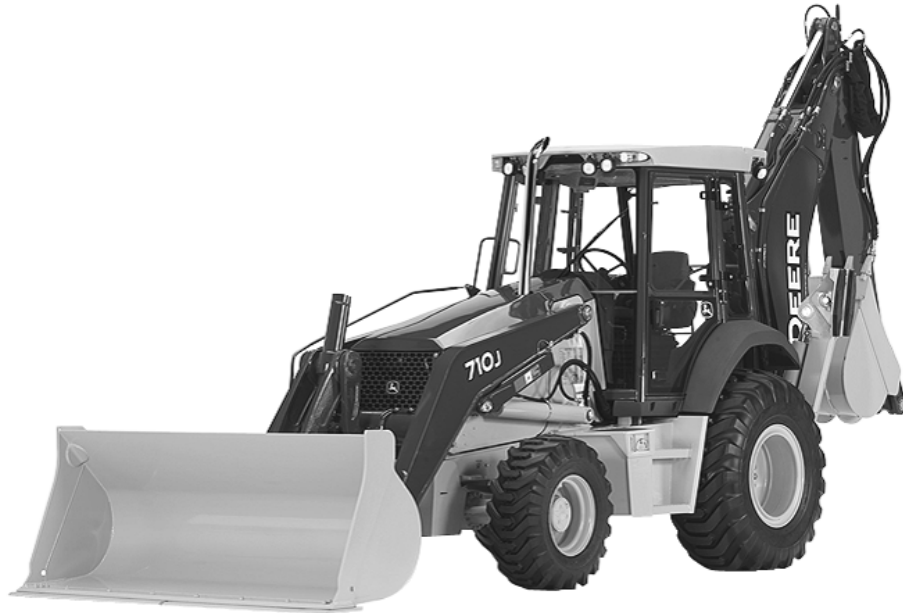
SIDE VIEW OF JOHN DEERE BACKHOE LOADER (MANUFACTURED 2007- )